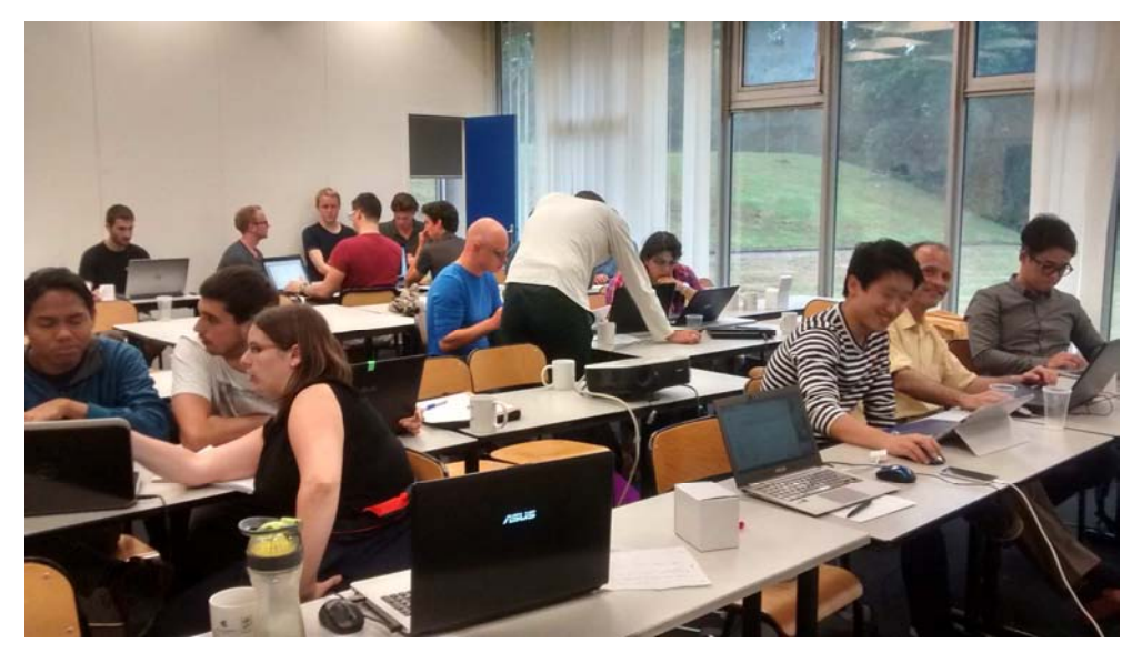
Some of the students performing wave analysis on day 2.