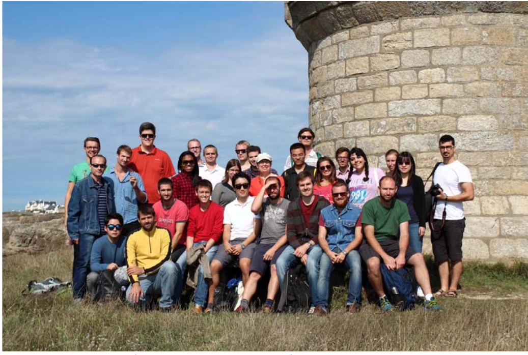
Group picture of the participants on Day 5 after the visit to the SEMREV test site

With 36 participants, the course was a great success. It was fully booked as early as April 2015. There are 13 names on the waiting list. 17 different nationalities were represented at the course: