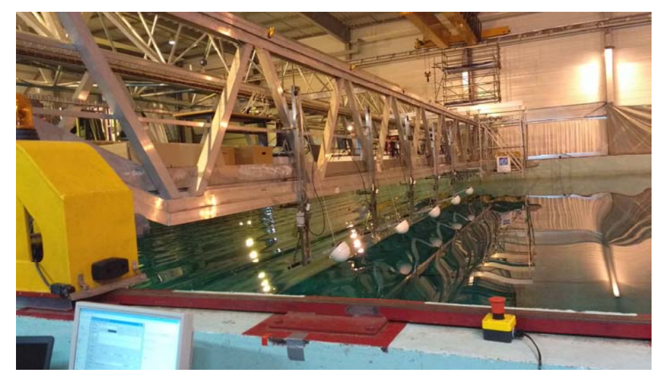
Picture of the 5 Wavestar absorbers installed in the wave tank of Ecole Centrale De Nantes. The participants performed experiments on these set-ups.